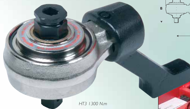
HT3 1300 N.m