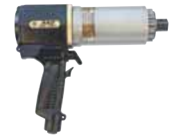
RAD ® 800NG-2