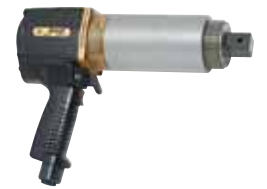
RAD ® 1400NG-2