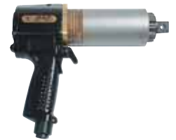
RAD ® 350SL-2