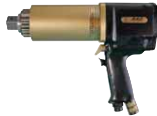
CE RAD ® 34GX