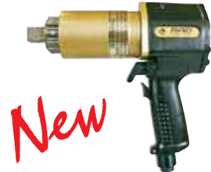
RAD ® 10GX