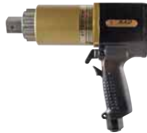
RAD ® 25GX