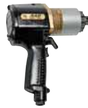
RAD ® 350SL