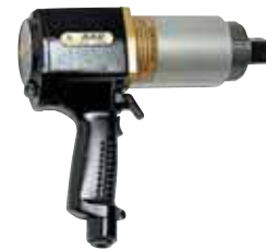
RAD ® 1800NG