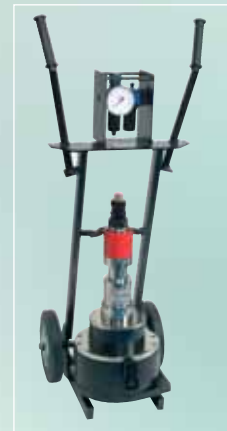
PT13 and PT14 are supplied on a trolley and with a Lubro Control Unit