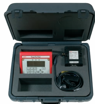
TST in standard carry case. STB1000 Transducer also shown.